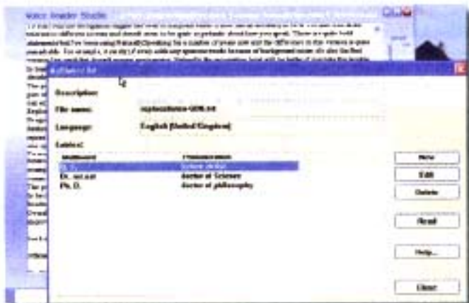
▲ It's very easy to set exceptions or add words to the vocabulary

Issue 984 ■ Visit us online at: www.micromart.co.uk