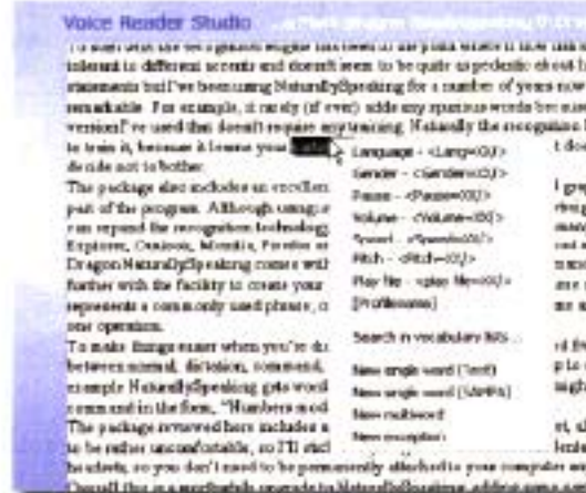
▲ The right mouse button accesses the adjustments menu.

a Microsoft Word document, also Rich Text Format, HTML files and plain old text from notepad. To hear the text spoken you simply highlight the paragraph, or click play at the bottom of the dialogue to hear the whole file. You have the choice of male or female voice and the program will show an